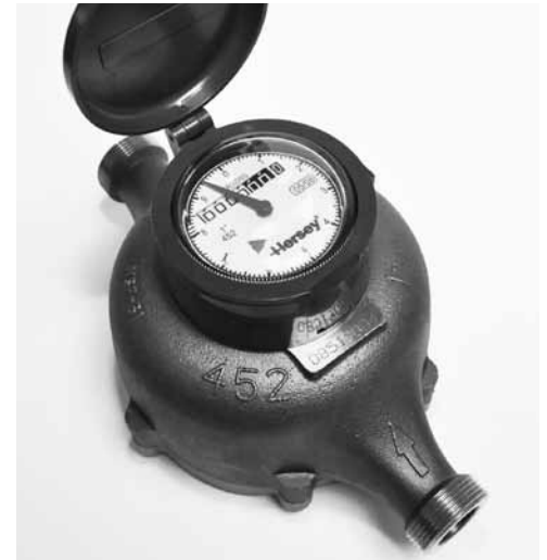
The Sub-meter Assistance Program provides well users with a 1-inch water meter to help monitor water use.

Permanent recharge. The GMP uses funds collected through well-user fees to purchase treated Colorado River water to permanently recharge the